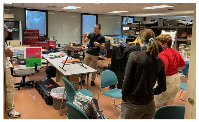
Demonstration of UAV and ground-based remote sensing systems used in agricultural and natural resource applications for UNL Honors program students.